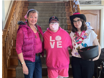
Halloween at the History Museum!