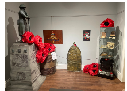
Remembrance Day Display

This year, Collections Staff completed the Artifact Inventory for the Civic Collections, which gives us a full picture of the scope of the collection for the first time. It has been years in the making, and we are very excited and proud to finally complete this goal. We also continued artifact cataloguing and are closer than ever to having a complete digital collections catalogue. We improved storage for over 600 artifacts with new folders, boxes, and cabinets. And finally, we used over 90 Civic Collections artifacts in exhibits and displays, highlighting the significance and diversity of the collection. In the new year, we hope to preserve and showcase even more of the Civic Collection to ensure the public can have even greater access to this great cultural resource.