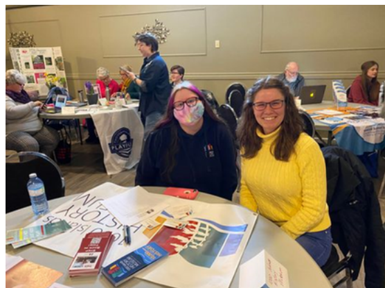
Gananoque Community Volunteer Fair