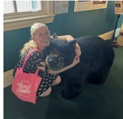
Fun at the Museum!