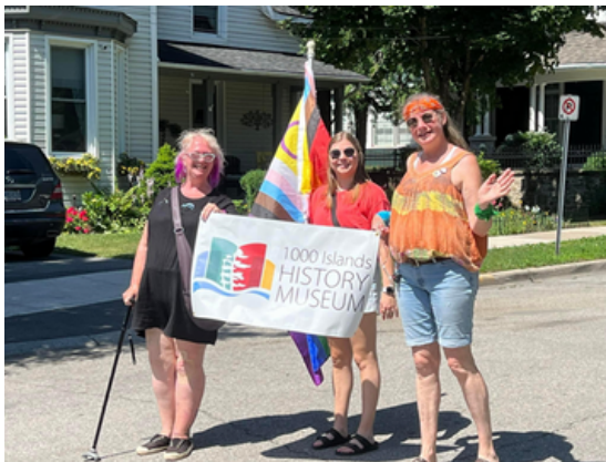
Gananoque Pride Parade