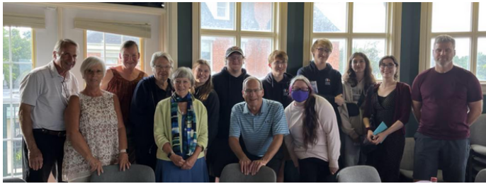
2023 Museum staff and volunteer appreciation party