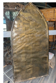
Grace United Church First World War Roll of Honour plaque that was saved from the 1979 fire.