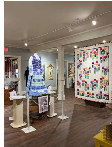
"From Away" exhibit: on display until June 2024