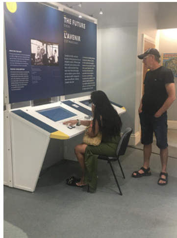
Seasonal exhibit: Eyes on the Skies