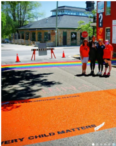
Painting the Truth and Reconciliation Walk